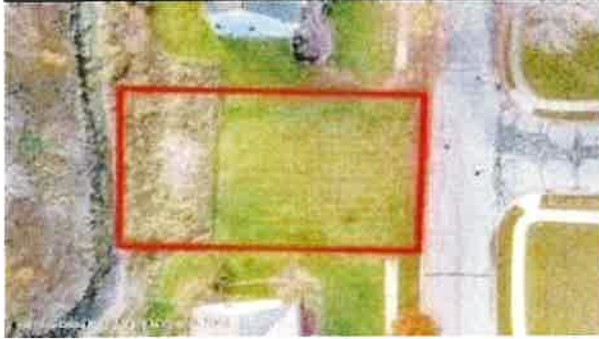
2495 Julie Way

List Price: $49,900 Road Surface: Paved Soil Types: Sandy Loam Trees: YES Lot Acres: 0.25 Lot Size Dimensions: 85X128 Frontage Length: 85 Land & Acreage: Up to 1/4 Acre Cross Street: W. Main St./Wilson St. City: DeWitt County: Clinton School District: DeWitt Elementary School District: DeWitt Elementary School: David Scott Elementary School Subdivision: Creeping Brook Township/Tax Authority: DeWitt Charter Twp Builder Name: GIGUERE HOMES Waterfront: No Directions: W Main St/Wilson St. Head N on Wilson St., Right on Julie Way Legal: LOT 88 CREEPING BROOK ESTATES NO. 7, SEC 5, T5NR2W. FROM 050-005-100-045-51 FOR 2004 ROLL.